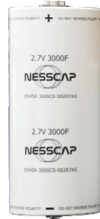
Dimension in mm (not to scale)